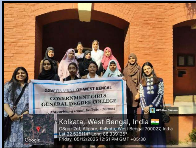
Students in front of the building that housed the cells in the jail where freedom fighters like C R Das and J M Sengupta were incarcerated