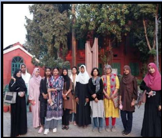
Students and faculty in front of Martyrs' Memorial