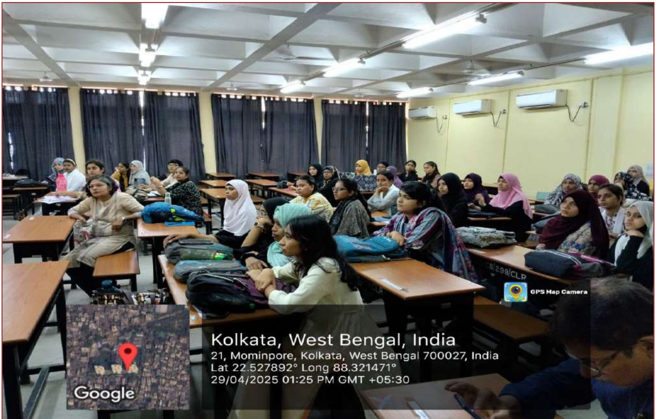
Participants of the programme