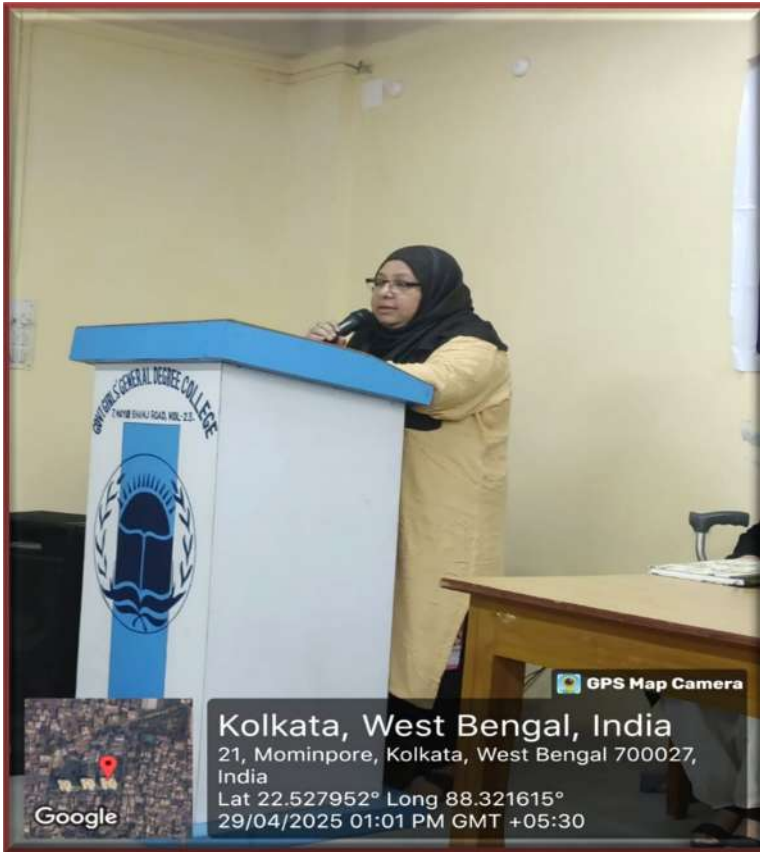
Inaugural Speech by Honorable Principle of the College GGGDC