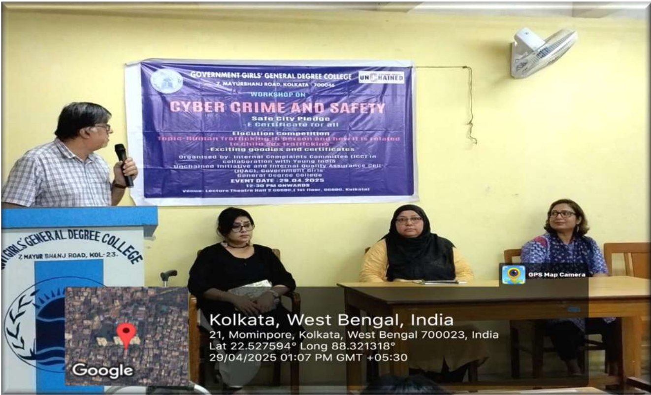
Inaugural Speech by IQAC Coordinator, GGGDC