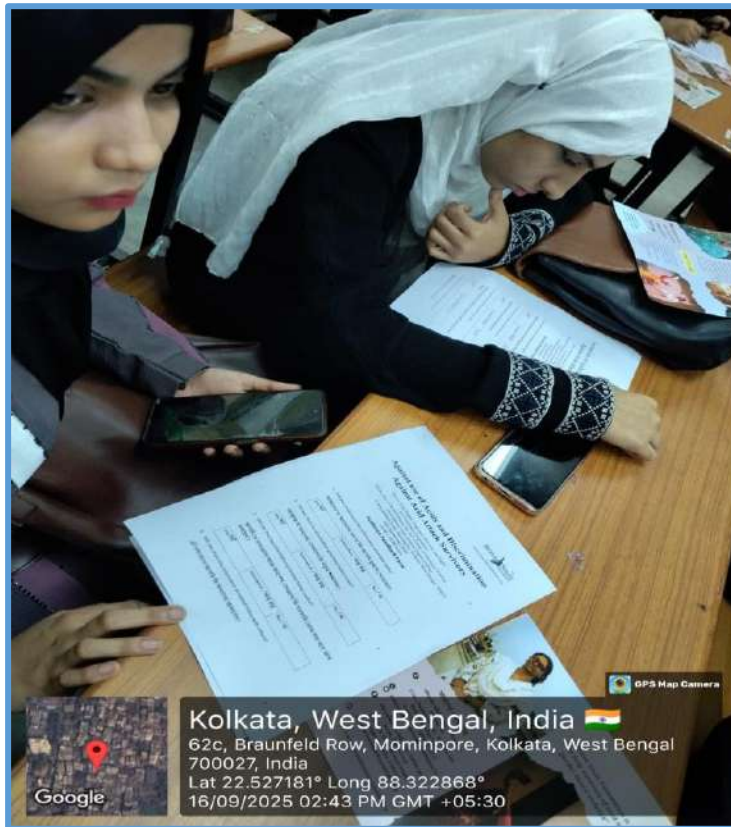
Fig 22. Feedback form submission