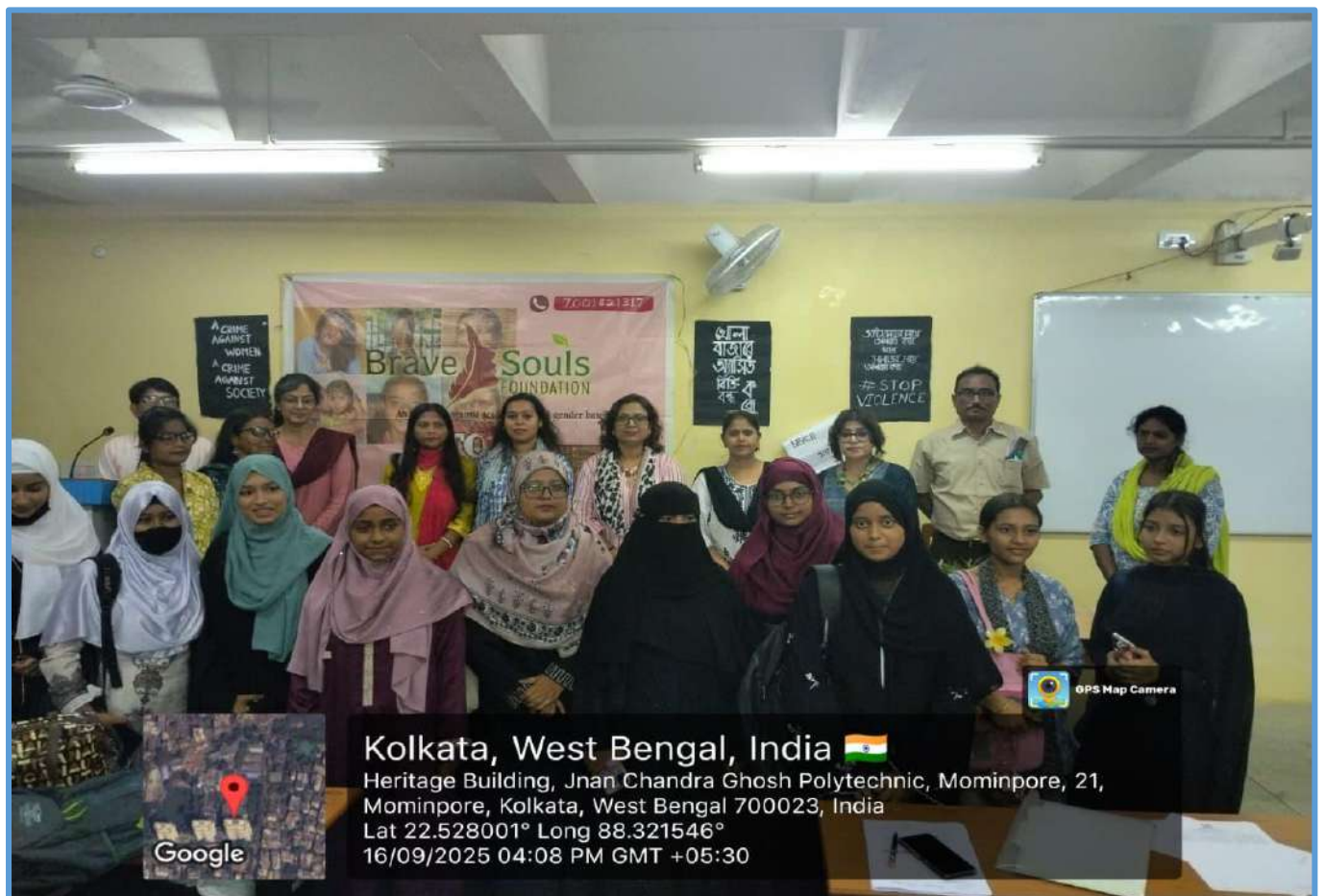
Fig 23. Photo Session by the Participants