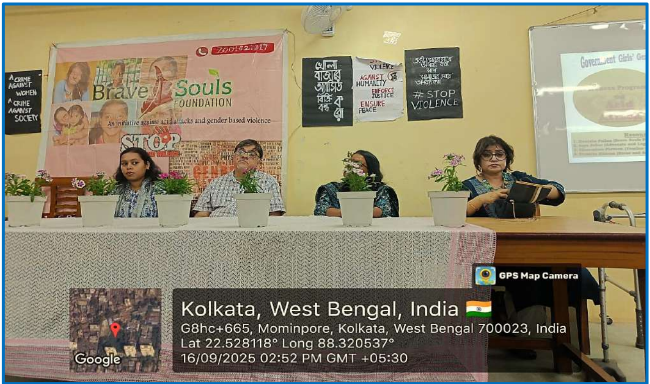
Fig 12. Inaugural session