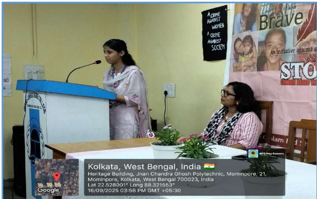
Fig 19. The interactive Session