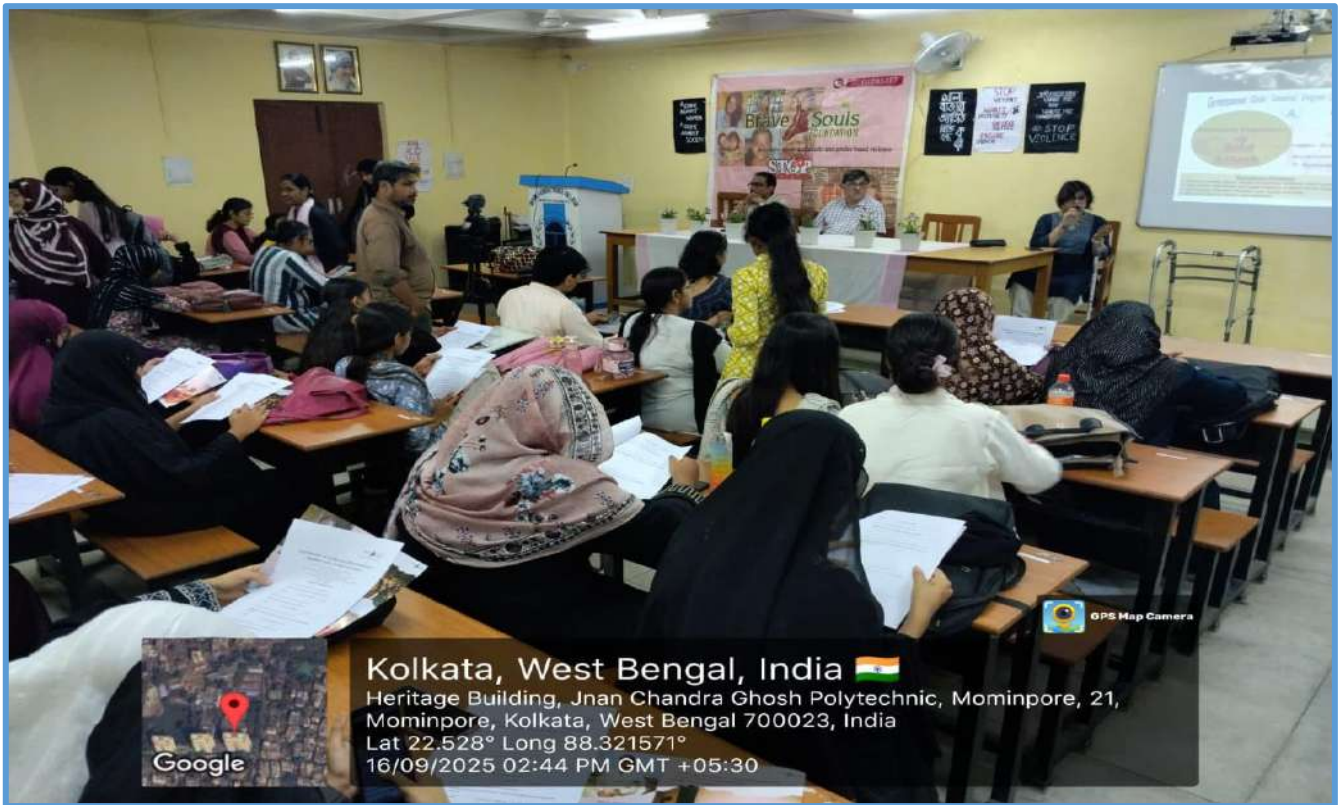
Fig 20. The interactive Session