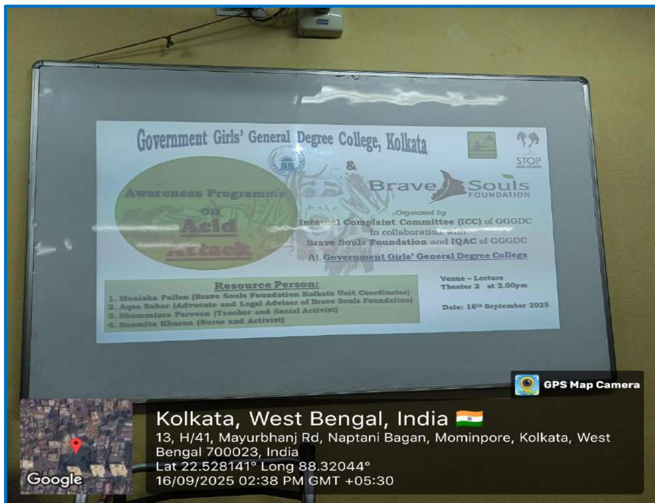
Fig 11. Flex of the Workshop