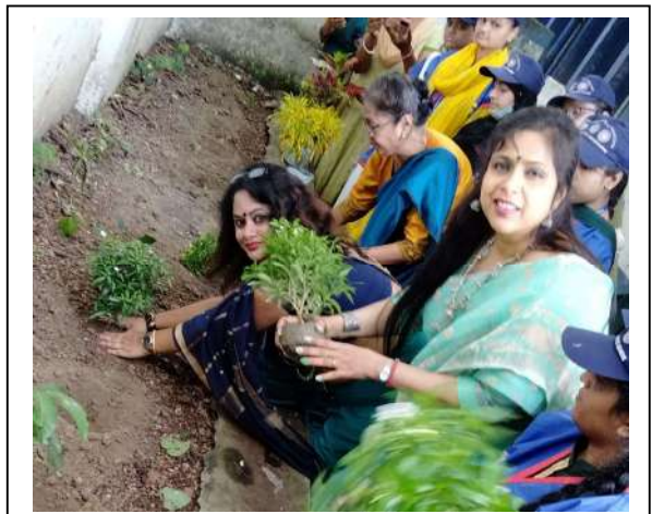
Plantation by the teachers