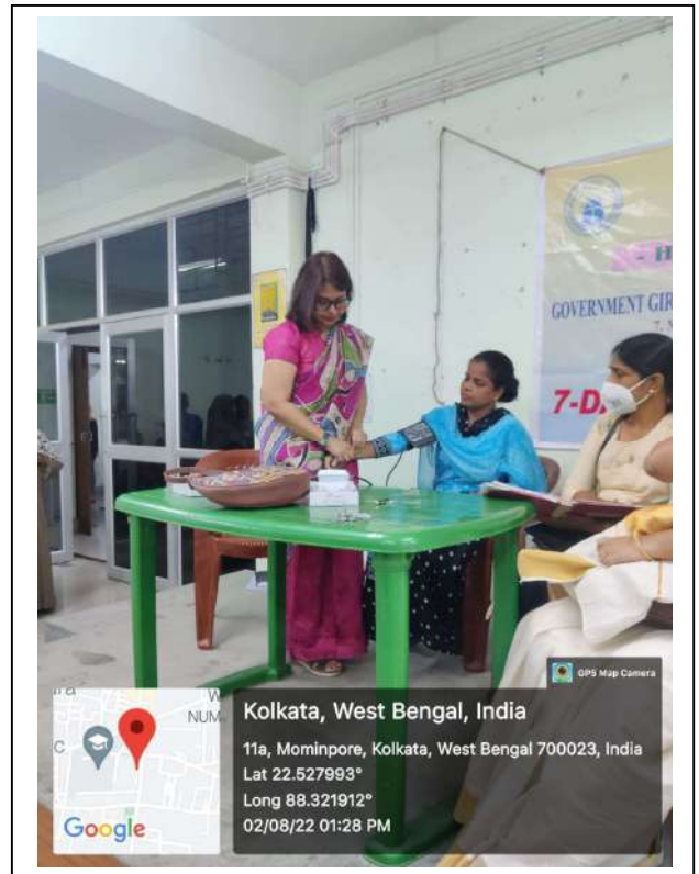
Doctor if examining a local lady