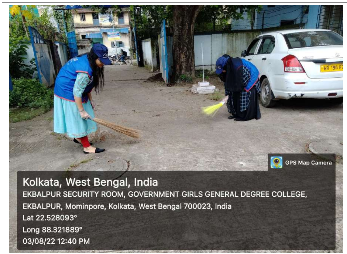
Campus cleaning by the NSS volunteers

On day 3 of the camp, the NSS volunteers arranged a campus cleaning programme. Volunteers did their best to clean our college campus. Teaching and non-teaching staffs of the college also helped them in this venture.