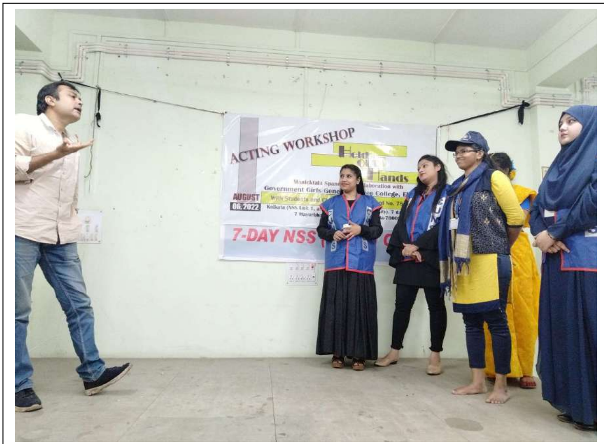
The resource person is giving acting training to the volunteers

Volunteers also performed chorus song, dance and recitation at the end of day 6.