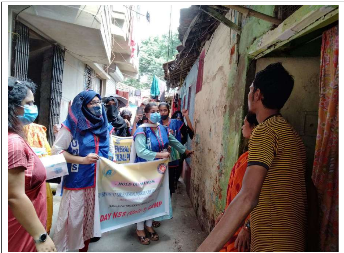
Volunteers are interacting with the slum dwellers

The NSS team of Government Girls' General Degree College Ekbalpur adopted a slum near the college. The slum is at Mayur Bhanj road, ward number 78, District Kolkata. NSS volunteers interacted with the slum dwellers, distributed masks and also invited them to participate in the upcoming events of this 7-Day Camp. NSS Programme Officer along with some other teachers of the college also visited the adopted slum.