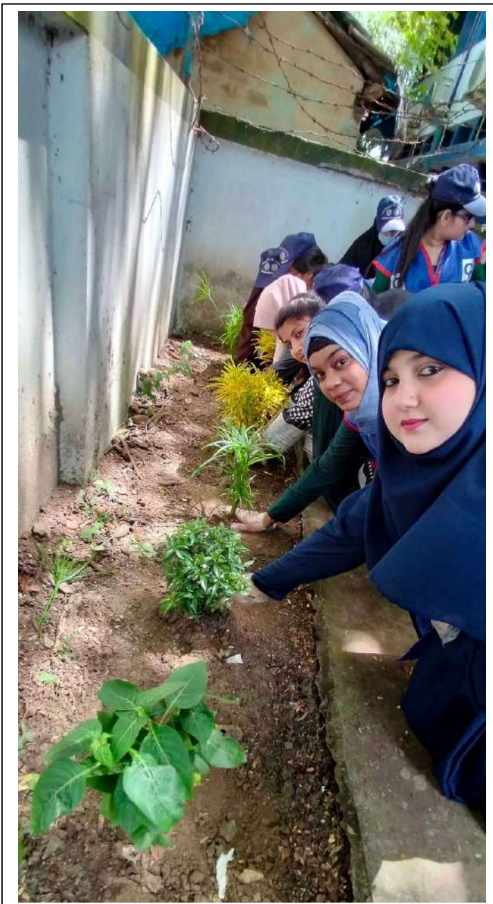
Tree plantation by the volunteers

On day 7 and the last day of this special camp, the NSS unit organised tree plantation programme at college campus. Almost thirty small trees were planted at different parts of the college campus. All the students, teachers and staffs did this job with great enthusiasm. At the end of the programme certificate of participation in the 7-Day Special Camp were given to the volunteers.