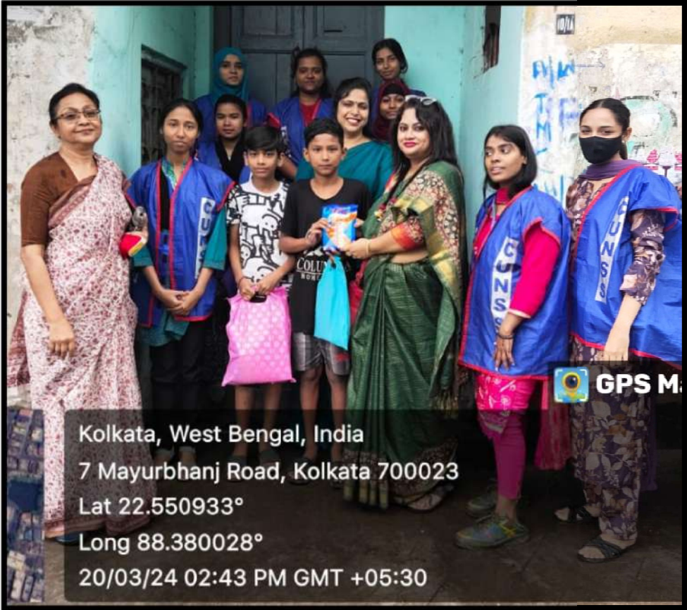
Distribution of Health Drink