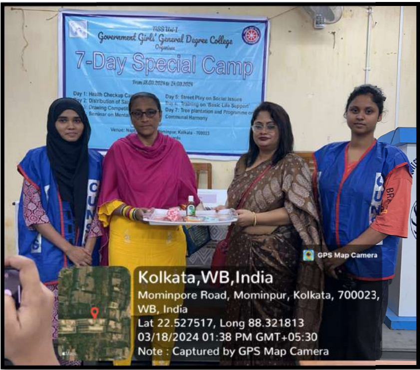
Distribution of medical kit