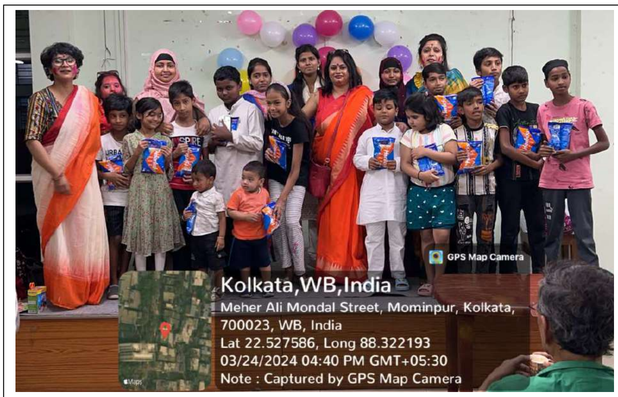
Distribution of Health Drink among the Local Children