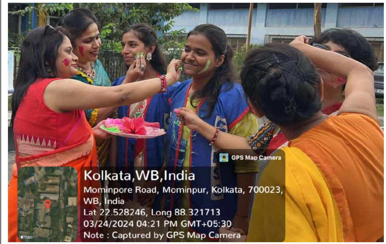
Celebration of Holi