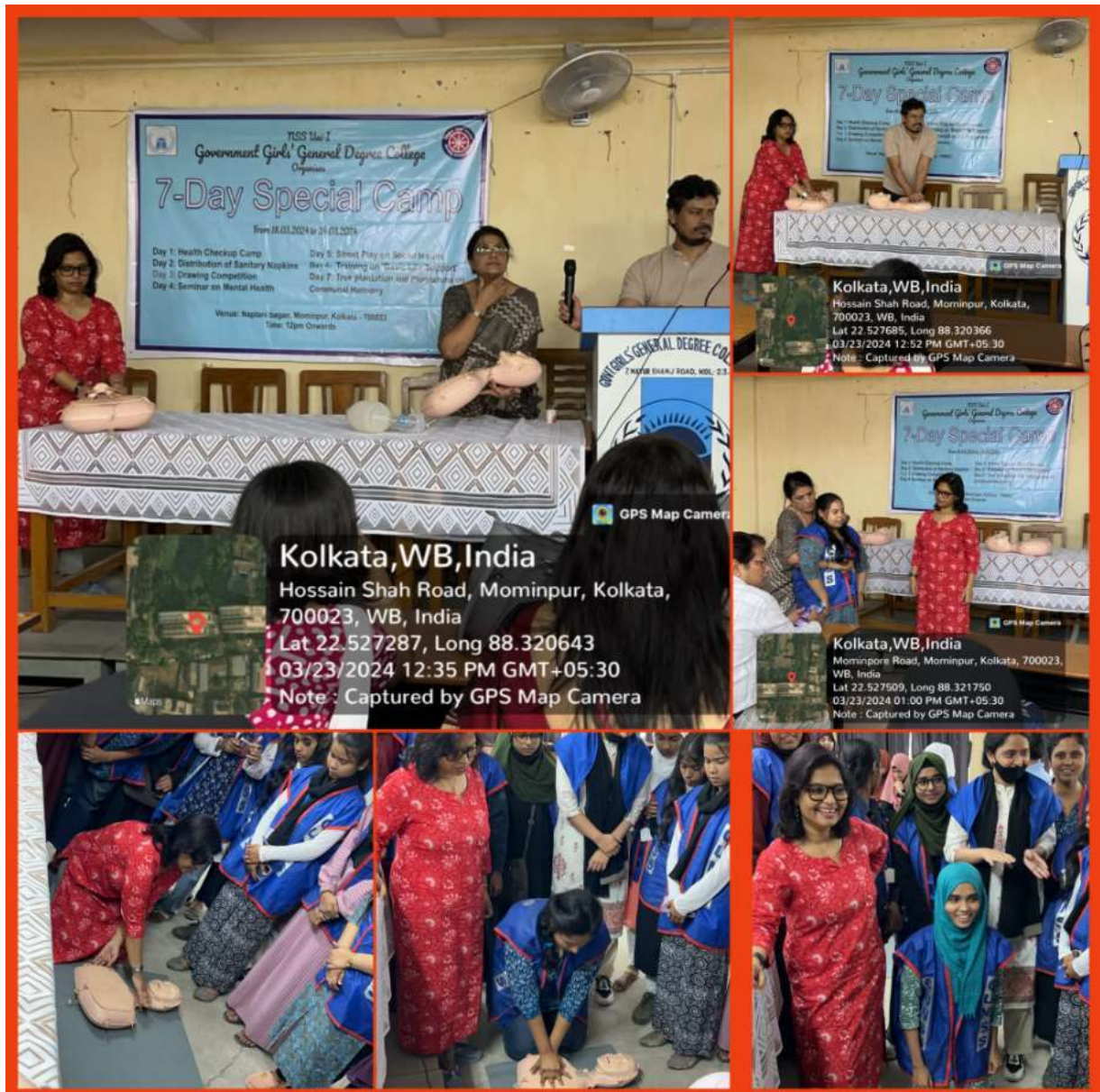
Workshop on 'Basic Life Support'

A workshop and training programme on 'Basic Life Support' was organised on the sixth day. A group of doctors from IPGMER, Kolkata conducted the session. Almost fifty volunteers took training on this day. This will definitely help them to save lives in future.