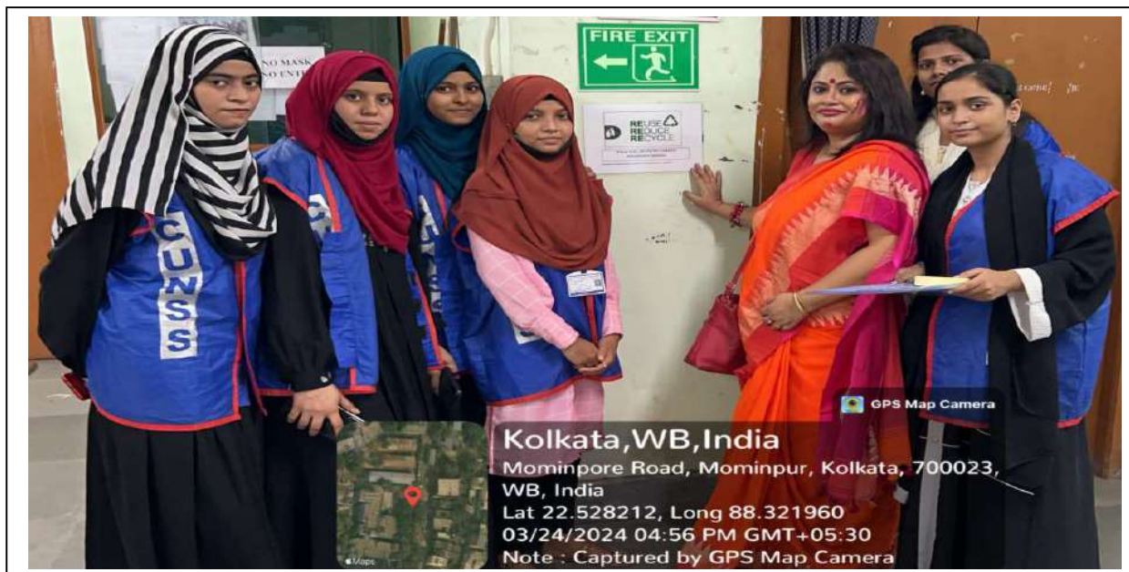
Poster Campaign to save our Environment