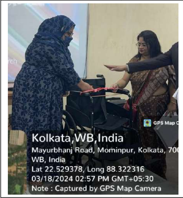
Donation of wheel chair