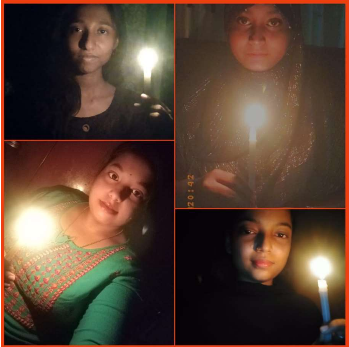
Celebration of 'World Earth Day'

In the evening, our NSS volunteers celebrated 'World Earth day' by switching off all the electric lights and living only on candles and diyas for one hour starting from 8 pm to 9 pm.