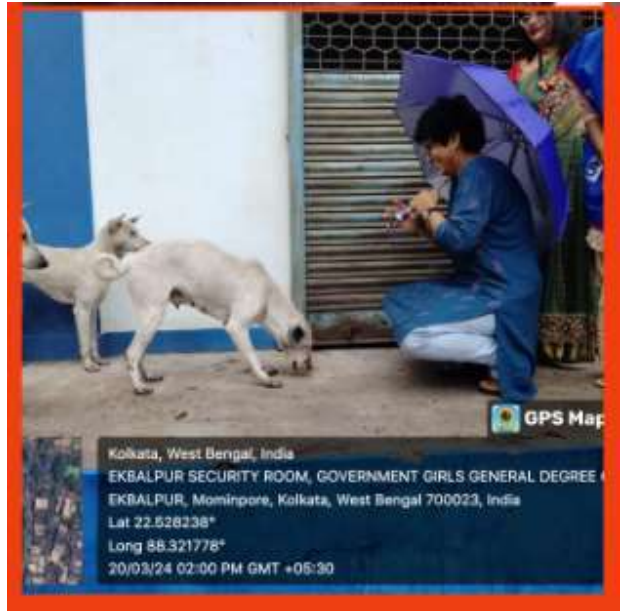
Feeding of street animals