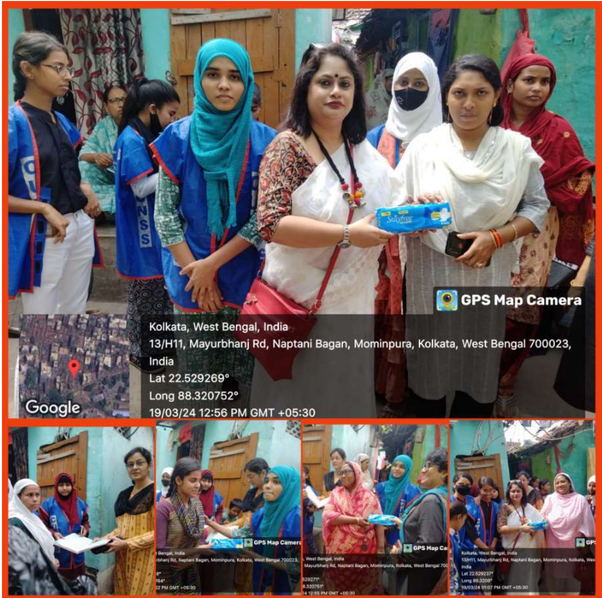
Distribution of sanitary napkins