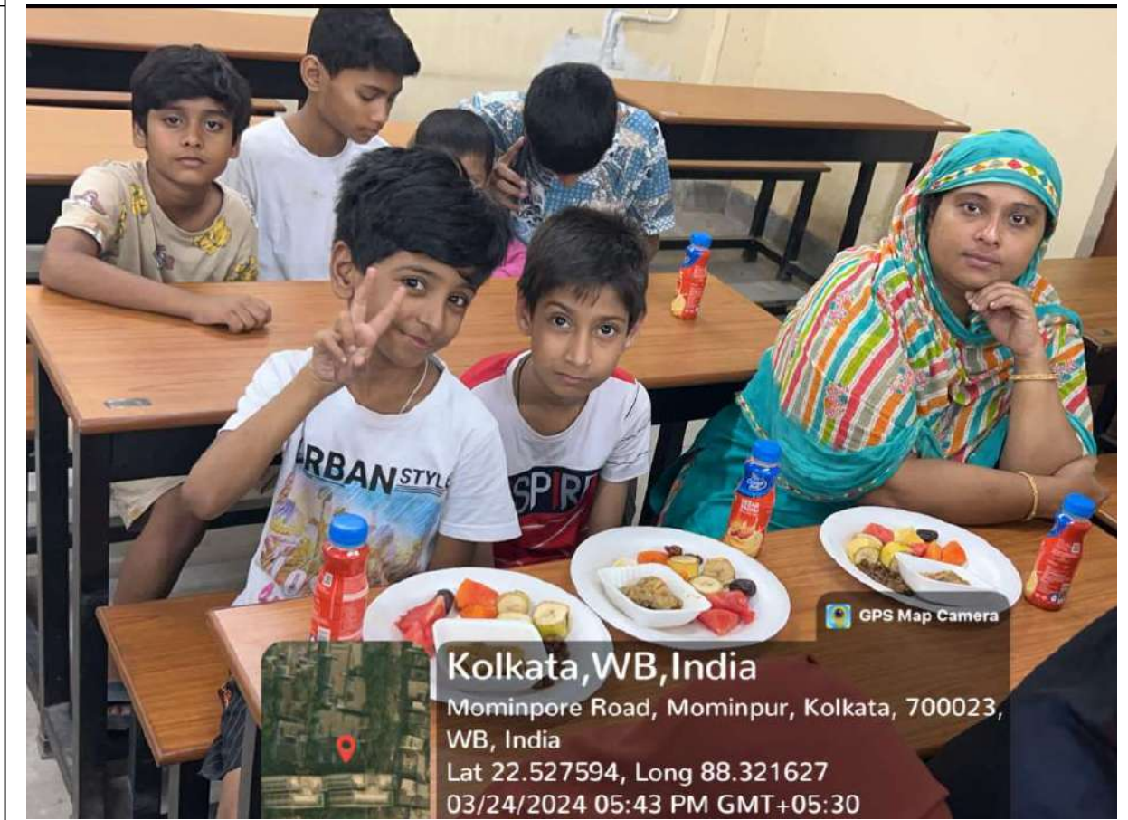
Iftar party with people from adopted slum