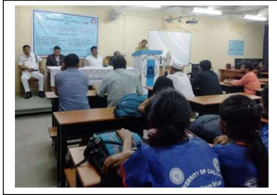
Lecture on Cervical cancer