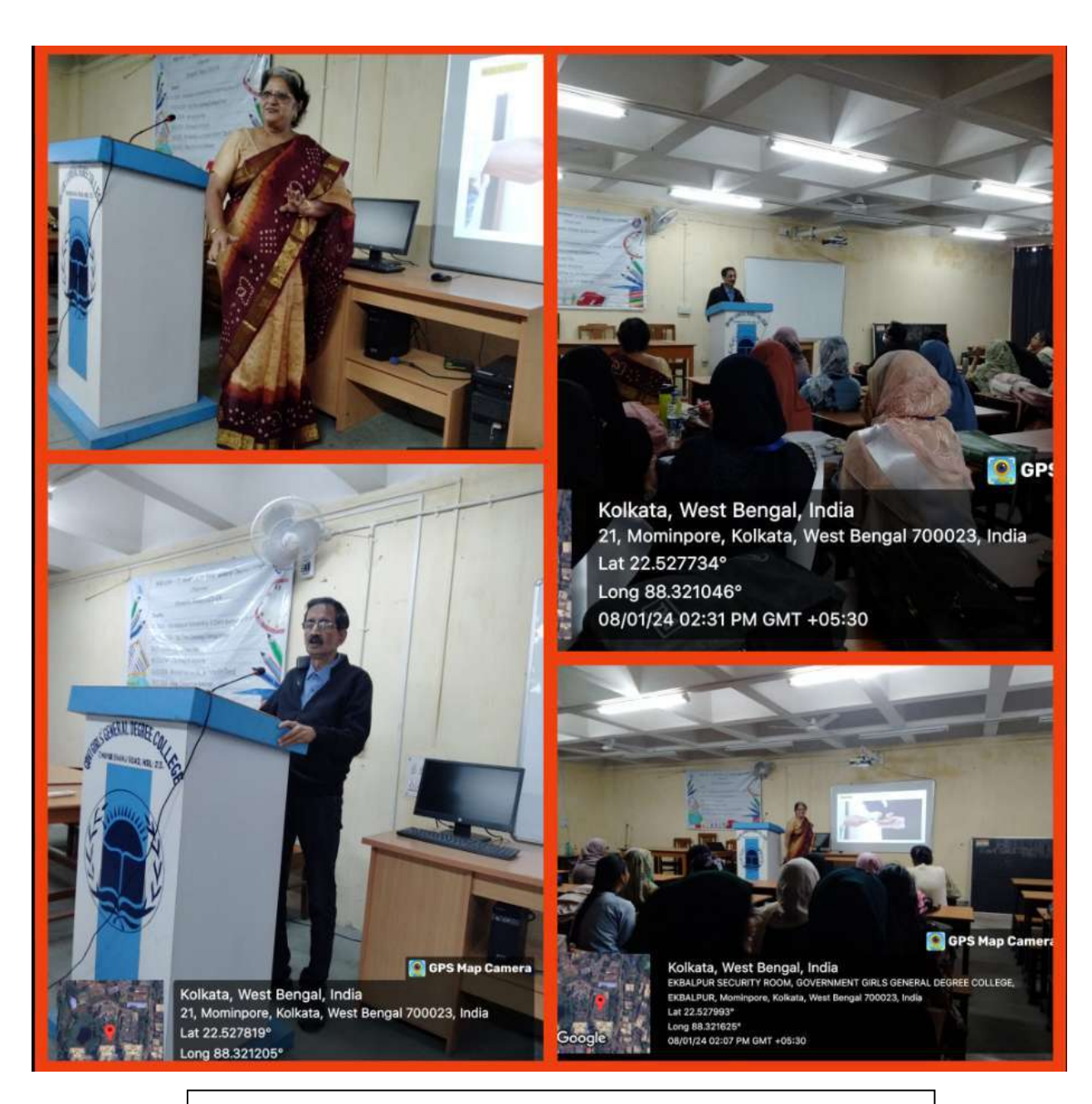
Value Education Seminar in our college