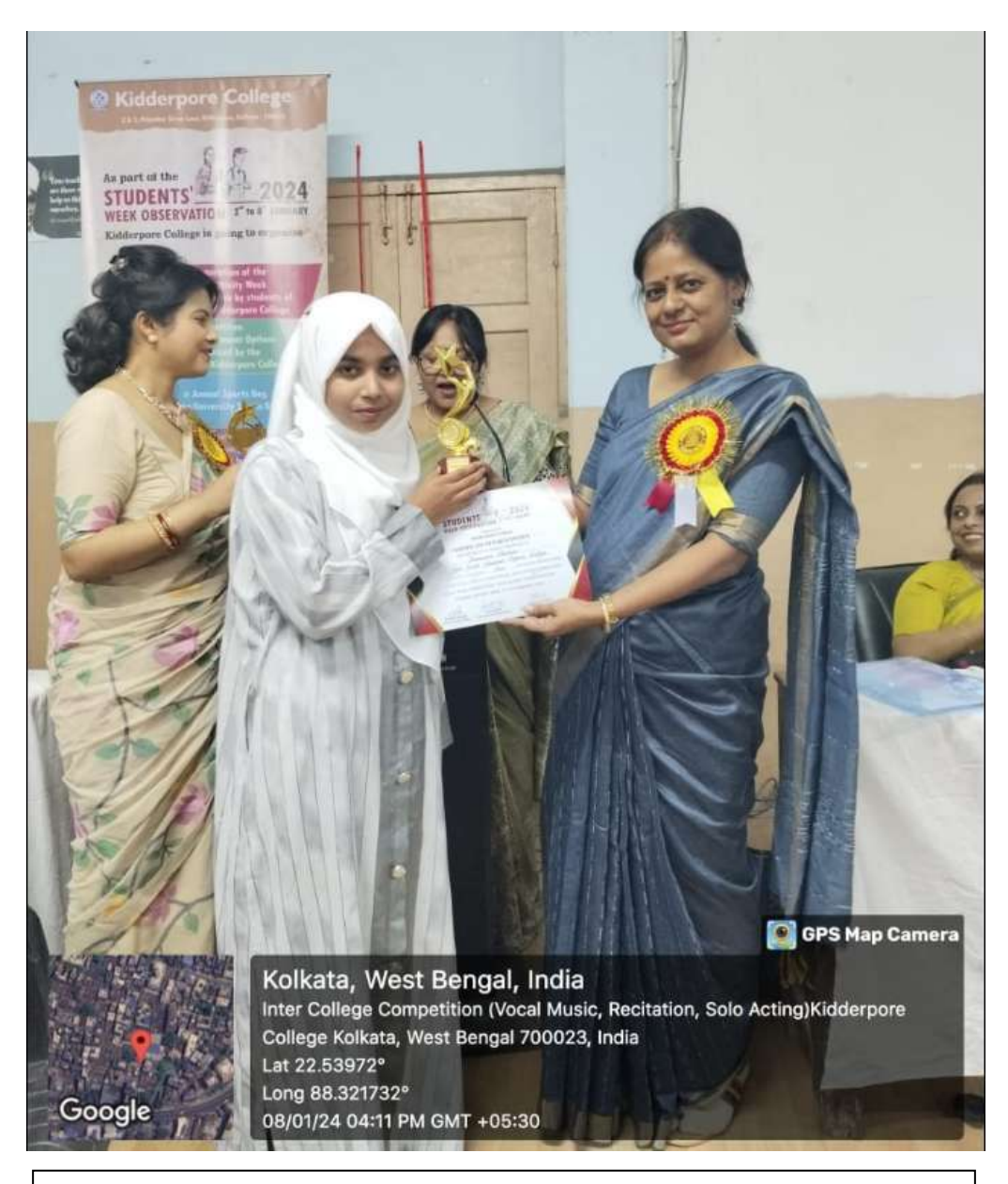
Receiving prize from Khiddirpur College

Thirty students went to Dhono-Dhanyo Auditorium along with our Principal madam and members of Social outreach cell to meet our honourable Chief minister. A small group of students with a member of cultural sub-committee went to Khiddirpur college to participate in inter-college cultural competition and also stood first in Recitation competition. From 2pm Value Education seminar was organised in our college by the Seminar sub-committee.