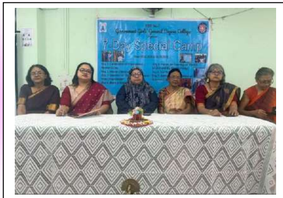
Delegates and faculties with Principal