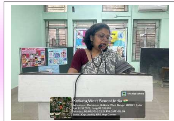
Speech on women empowerment