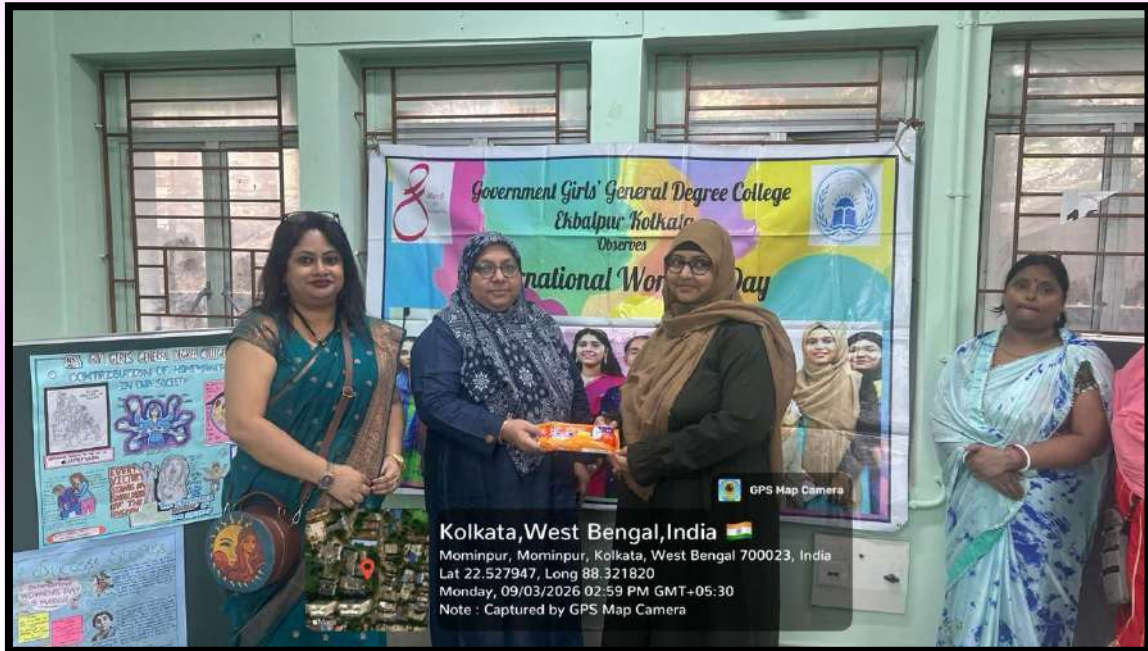
Distribution of Sanitary Napkins

The programme of the first day ended with the distribution of Sanitary Napkins among the women of the locality.