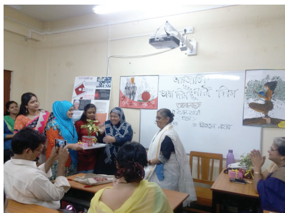
SMART CLASS ROOM