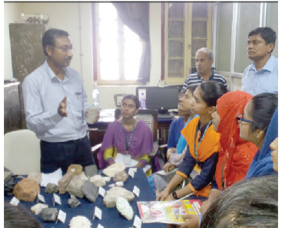
GEOLOGICAL SURVEY OF INDIA. STUDY TOUR BY DEPT. OF GEOGRAPHY