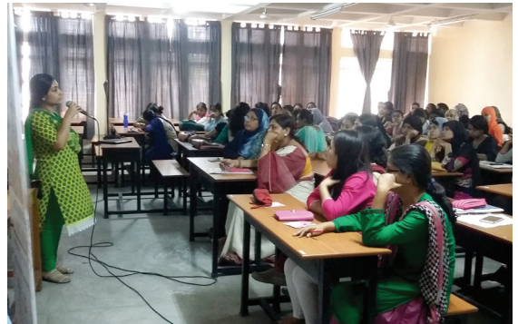
WORLD HEALTH DAY, 2018