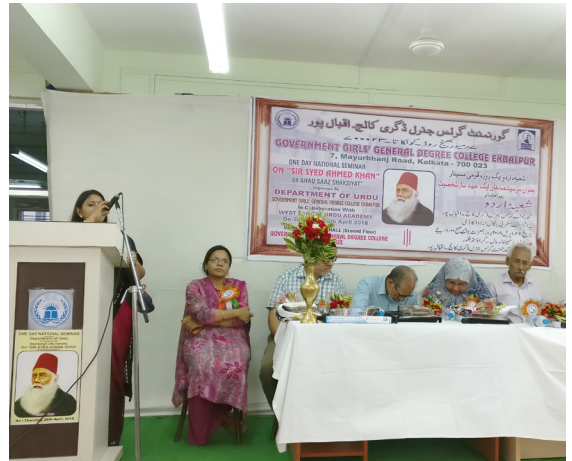
NATIONAL SEMINAR CONDUCTED BY DEPARTMENT OF URDU