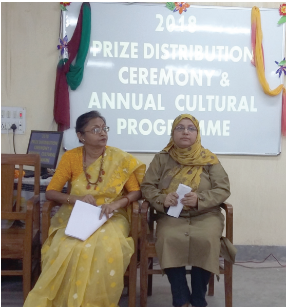
PRIZE DISTRIBUTION AND ANNUAL CULTURAL PROGRAMME, 2018