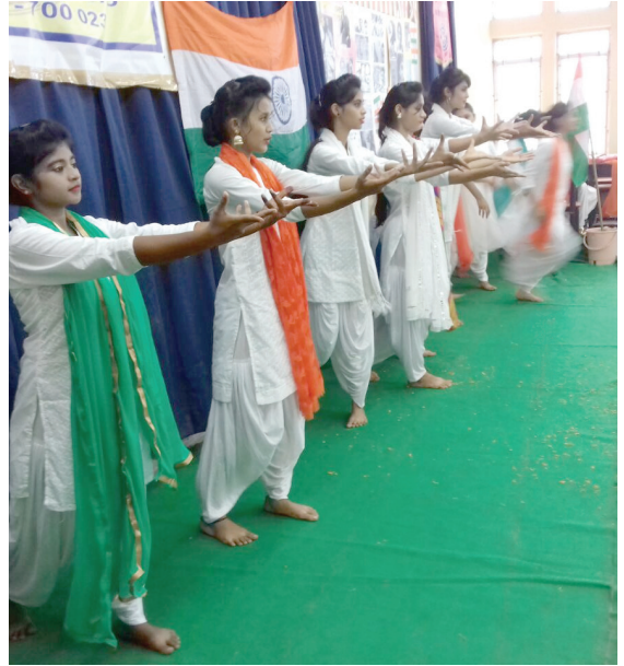
DANCE PERFORMANCE BY STUDENTS