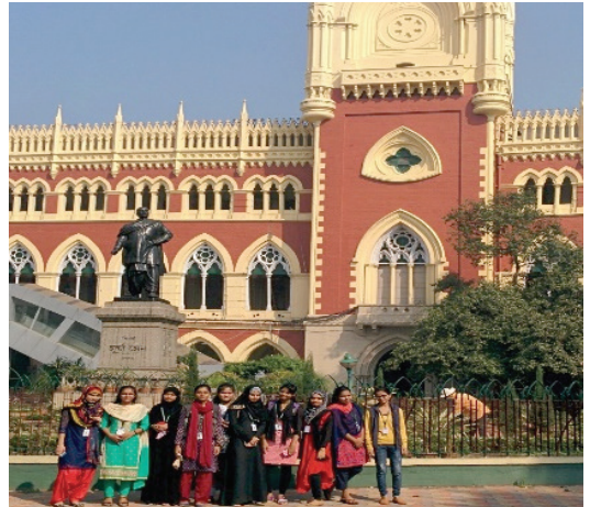
STUDY TOUR BY DEPARTMENT OF POLITICAL SCIENCE.