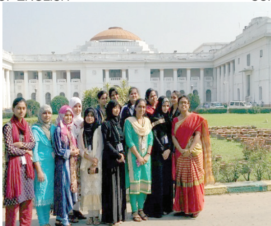
STUDY TOUR AT VIDHAN SABHA BY DEPARTMENT OF POLITICAL SCIENCE.