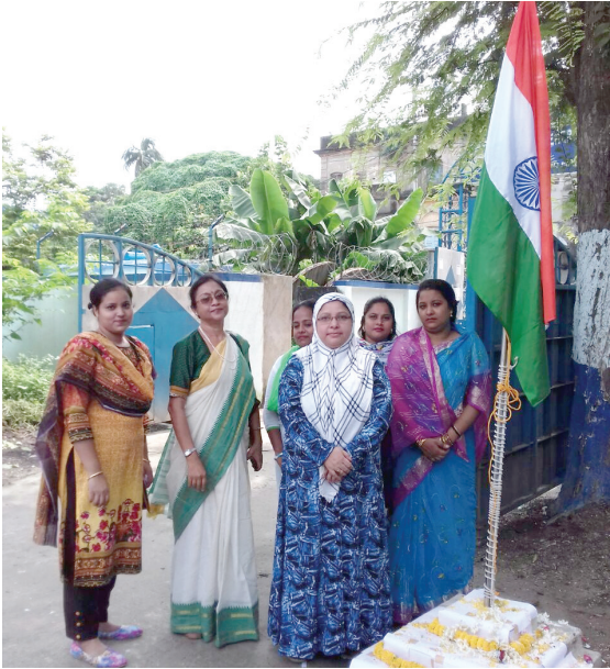
FLAG HOISTING ON REPUBLIC DAY, 2018-19