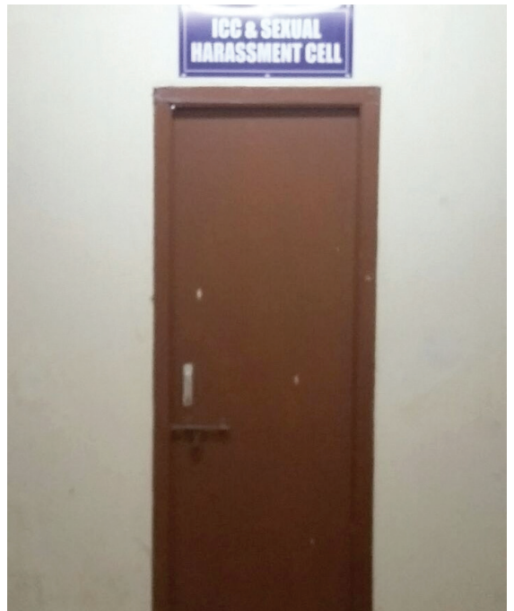
ICC AND SEXUAL HARRASEMENT CELL.