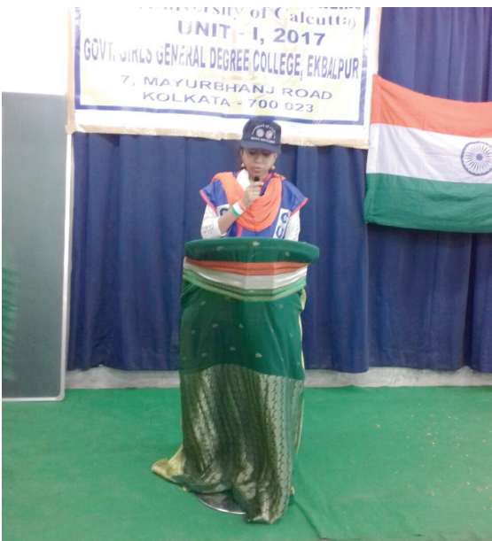
NSS STUDENT RECITING ON IDEPENDENCE DAY, 2017-1018