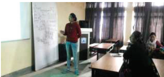
A STUDENT FROM CHEMISTRY DEPARTMENT DELIVERING HER LECTURE DURING THE SEMINAR