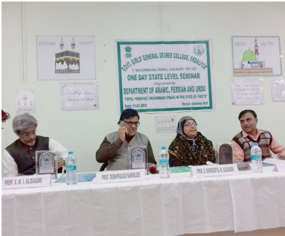
NATIONAL SEMINAR. CONDUCTED BY DEPT. OF ARABIC, PERSIAN AND URDU