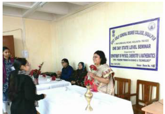
ONE DAY STATE LEVEL SEMINAR CONDUCTED BY DEPT. OF PHYSICS, CHEMISTRY & MATHEMATICS