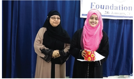
FOUNDATION DAY, 2018-19