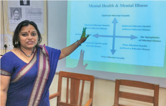
PSYCHOLOGICAL COUNSELING SESSION