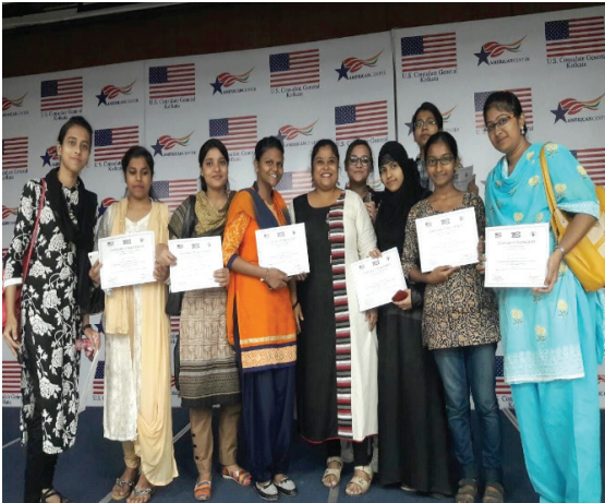
STUDY TOUR AT AMERICAN CENTER BY DEPARTMENT OF ENGLISH