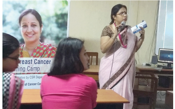
WORLD HEALTH DAY, 2018