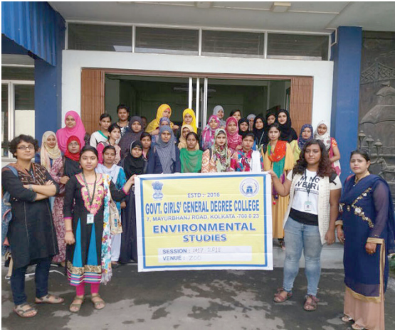
FIELD STUDY BY ENVIRONMENTAL STUDIES, 2018-19.