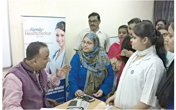
HEALTH CAMP ON WORLD HEALTH DAY, 17