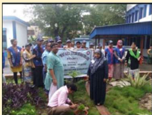
ENVIRONMENTAL DAY CELEBRATION IN COLLEGE CAMPUS

acts on patriotism, and dance performances showing national integrity. NSS Unit students also showed their respect towards the country through painting and displaying posters of unforgotten martyrs.