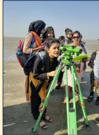
Students performing surveying and levelling