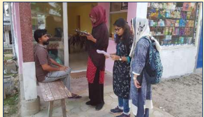
Students engaged for Market Survey at Bakkhali