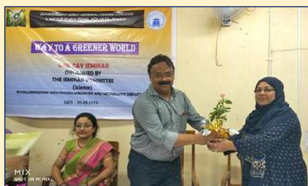
Felicitation of the Guests by the Principal