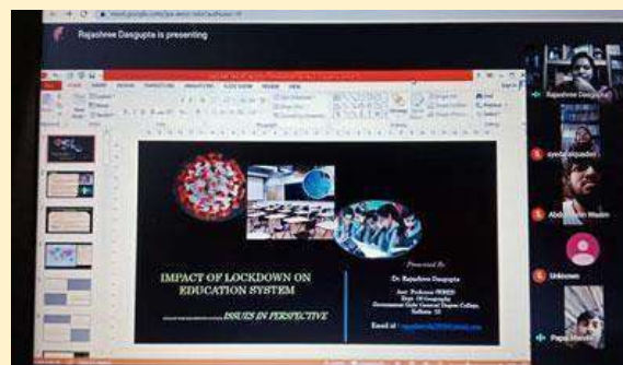
Topic for the webinar