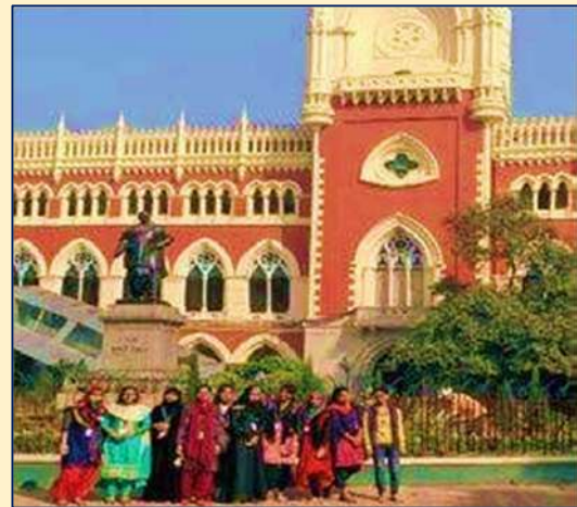
Study Tour by Department of Political Science