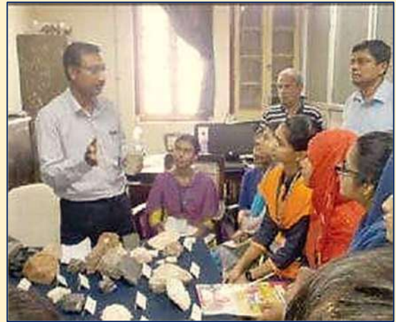
Geological Survey of India Study Tour by Department of Geography