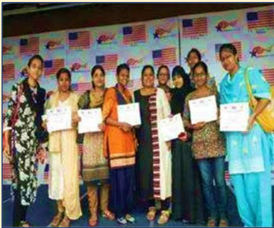
Study Tour at American Centre by Department of English