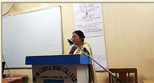
Convener of Cultural-sub-Committee is delivering an Introductory Speech