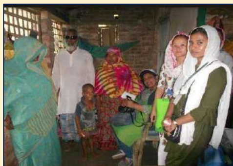
Interviewing at the household level, Dhamakhali Village, Sandesh Khali II Block, North 24 Parganas, West Bengal