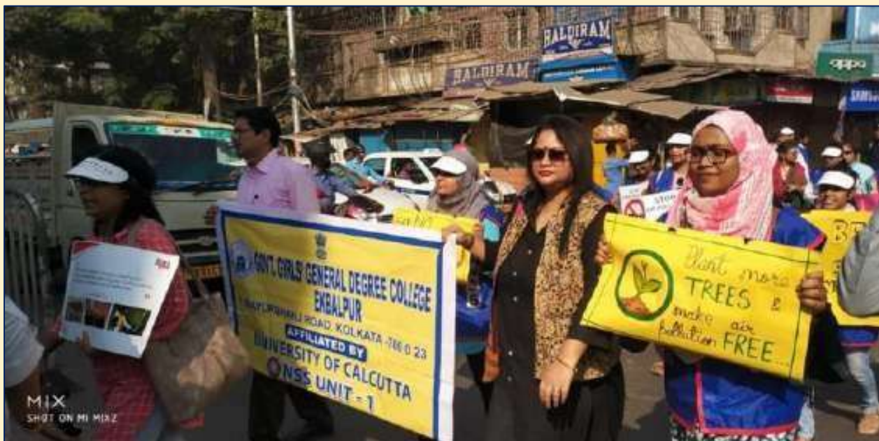
A walk from Khidirpur to our college was conducted by NSS Unit-I on 28-09-2019 to protest against the use of plastics. Students of NSS also prepared posters on how to save our environment.