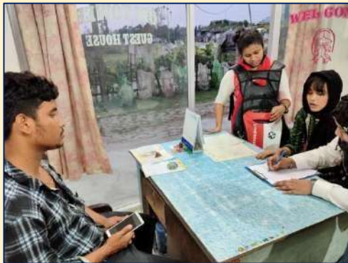
During Hotel Survey at Bakkhali