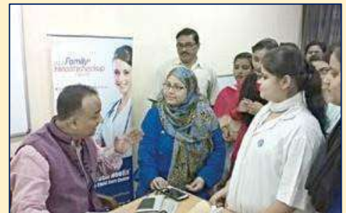
Health camp on World Health Day