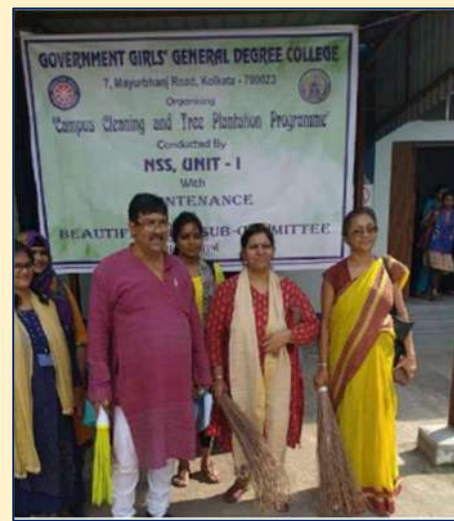
"Campus Cleaning and Tree Plantation Programme" was conducted by NSS Unit-I in collaboration with the Maintenance sub-committee of the college on 12-09-2019 on the college campus. Faculty members and students of different departments participated in the program actively.