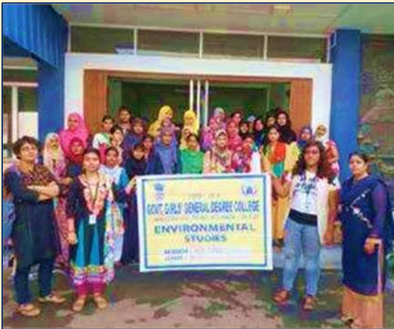
Field Study by Environmental Studies