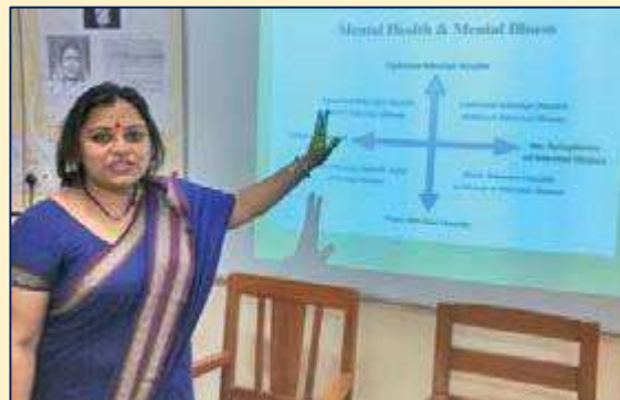
Psychological Counselling Session