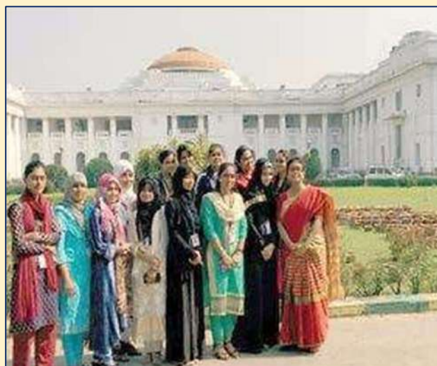
Study Tour at Bidhan Sabha by Department of Political Science