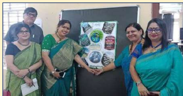
The Organizing Committee