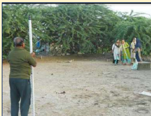
Students performing surveying and