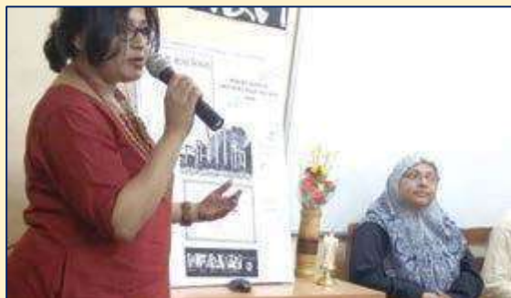
Dr. Sampa Sen on International Mother Language Day