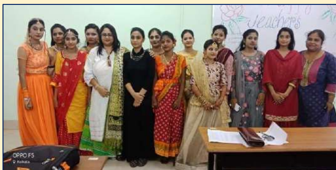
All the participants of the 'Dance Competition' with the

The cultural sub-committee of our college organized an “ Intra-College Cultural Competition ” from 24 th to 26 th September 2019 among the students of all the departments. The competitions were divided into 8 sections namely singing, dancing, solo acting, extempore, art and craft, rangoli making, painting, and debate. The students showed excellent performances in all the sections.