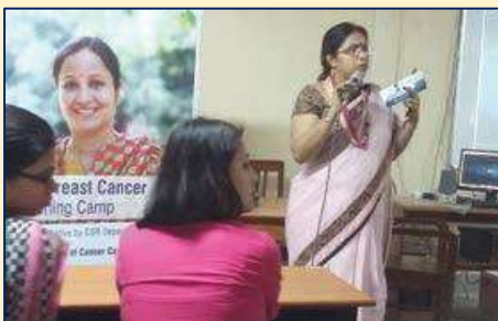
World Health Day