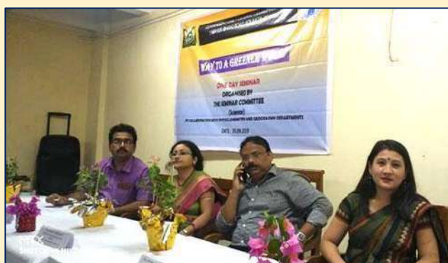
The Resource Persons

There was also a poster presentation competition among the students. Students from all the above four colleges participated in the competition.