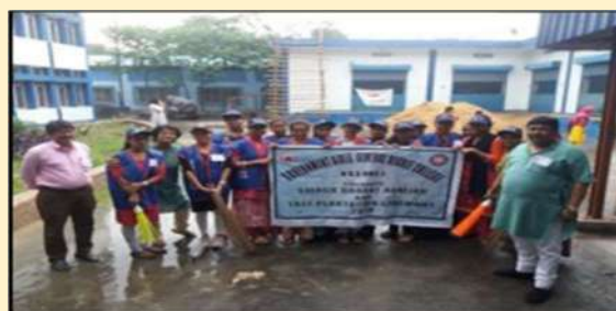
NSS Unit 1 Students in Swachh Bharat Abhiyan

acts on patriotism, and dance performances showing national integrity. NSS Unit students also showed their respect towards the country through painting and displaying posters of unforgotten martyrs.