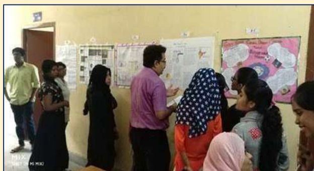
Evaluation of the Posters by the Experts