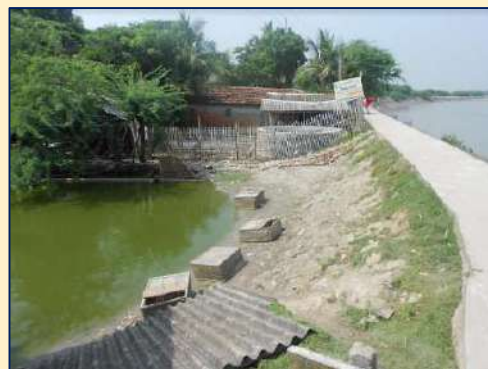
Riverside households in Dhamakhali Village