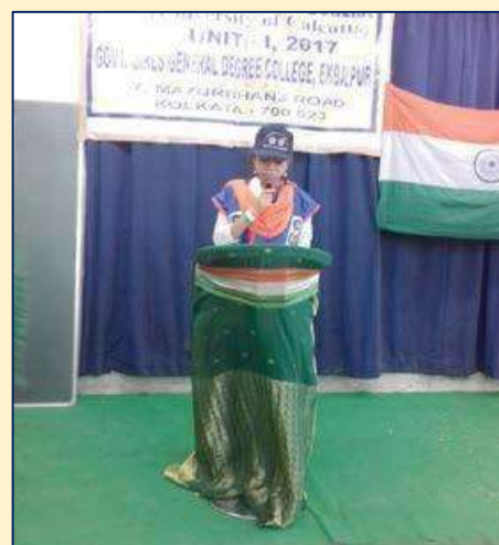
NSS Students reciting on Independence Day