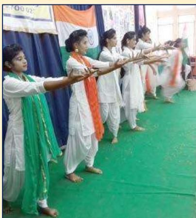
Dance performed by students on Independence Day celebration