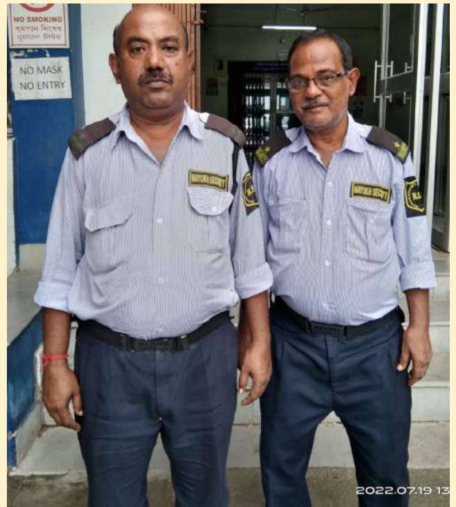
College Security Guard